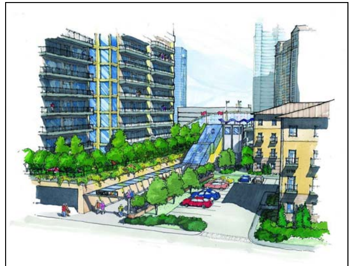
Artist's depiction of the Northern Concourse, viewed from the Stratford Road side of GA400.

In September, NBCA and Post Properties executed an agreement that permits North Buckhead residents access the new path and park during daylight hours. The full text of the agreed-upon rules are posted on our web site at www.nbca.org/parks/post_alexander . The map below shows the area involved in this agreement.